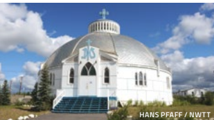
HANS PFAFF / NWT

Wildlife abounds in Canada's Arctic. Follow the country's only reindeer herd during its annual migration or photograph majestic muskoxen on Banks Island.