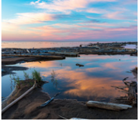
WEST CHANNEL BEACH NEAR HAY RIVER