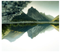
IN SHAMER CONNOR FURBERG / NWT